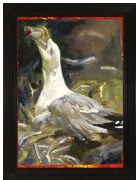
Jamie Wyeth, Gluttony, 2005. Combined mediums on hand-wove, toned paper mounted on archival board. 34 ½ x 24 ¼ inches.

This is a must see show and runs through May 22 at the Salt Lake Art Center, 20 S. West Temple, show hours Tue-Thur and Saturdays, 11am-6pm, Friday, 11am-9pm, closed Sunday and Monday. Phone 801-328-4201 or www.slartcenter.org for more info.