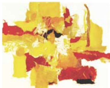
Top: Feeling Festive , bottom: Moon Weaver .

Sylvia will be donating an original collage painting to be auctioned off for one of the Western Federation Show awards.