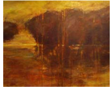
Bear River Refuge